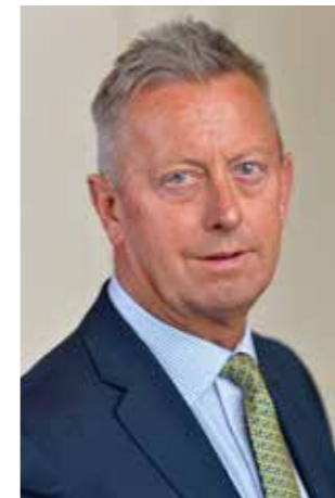
MARTYN KONIG CHAIRMAN OF THE BOARD OF DIRECTORS

postponement of the hot commissioning by 6 months to rework the fabrication of key module components and further reduce ramp-up risk. The project remains the right strategic decision for Nyrstar and will have a significant positive long-term effect on our operations and deliver a substantial earnings uplift in the region of EUR 130 million per annum (from 2020), maximising returns to our stakeholders.